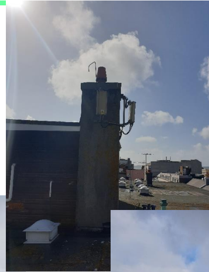
Stafford Hotel 4.9% of ICNIRP limit