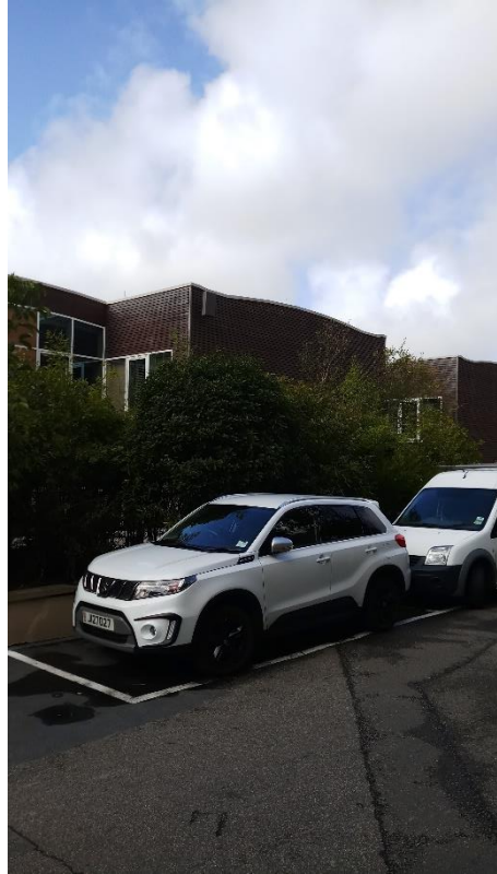
Hotel de France Lido, JE