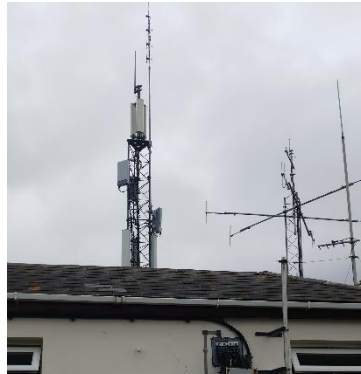
Cooperative Grand Marché 5.2% of ICNIRP limit