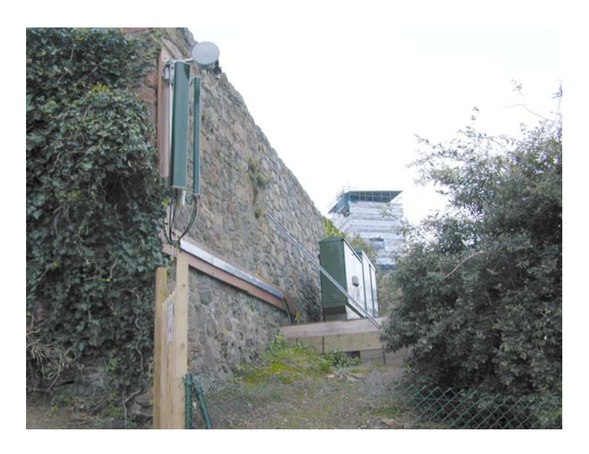
Figure 1 Antenna at Mignot Plateau

Access to the Beau Sejour and the airport tower roofs are through locked doors, while the antenna at Mignot Plateau is wall-mounted but is within touching distance (see Figure 1 below). The antennas at JEC Telecom hut and Smith Street shop on the other hand are only at 2.2m and 1.5m above ground respectively and are easily within reach, although neither site is in an area accessible to the general public.