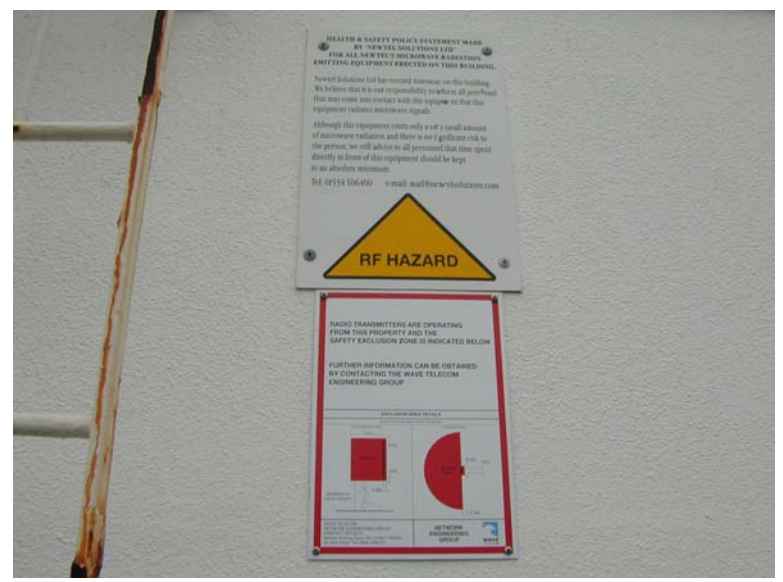
Figure 2 Photograph of poster by the Beau Sejour antennas (Newtel and Wave signs)

existence of an electromagnetic radiation source. At Beau Sejour, the sign was found at the base of the roof section hosting the antenna as shown on the photograph in Figure 2 below, and on the door leading to the roof. At Mignot Plateau, the sign was found on the gate at the bottom of the path leading to the antenna.